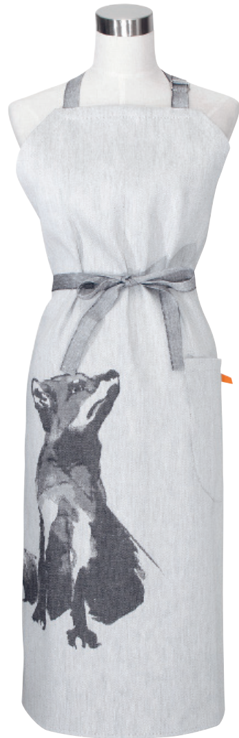
KETTU x Teemu Järvi apron 120x70 cm, col. white-black, linen-bio-organic cotton, design Teemu Järvi

MAIJA dish cloth 25x32 cm, col white-olive, washed linen-tencel-cotton, design Lapuan Kankurit