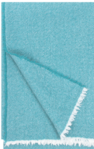
HALAUS scarf 70x200 cm, col. petroleum, 100% washed linen, design Lapuan Kankurit