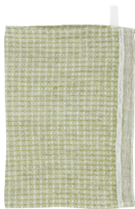
HIMMELI towel 48x70 cm, col white-linen 100% washed linen, design Eri Shimatsuka

MAIJA towel 48x70 cm, col white-aspen green washed linen-tencel-cotton, design Lapuan Kankurit