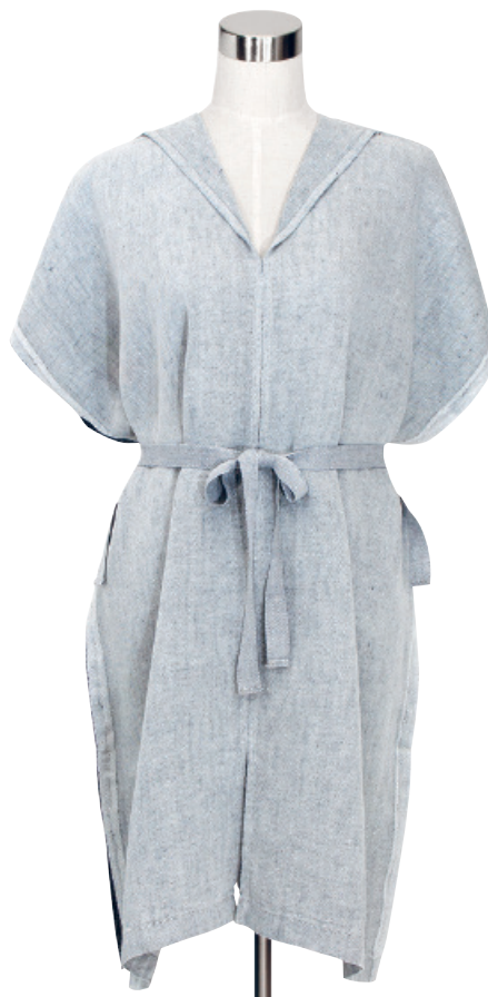
KASTE ladies garment col. grey 100% washed linen, design Anu Leinonen