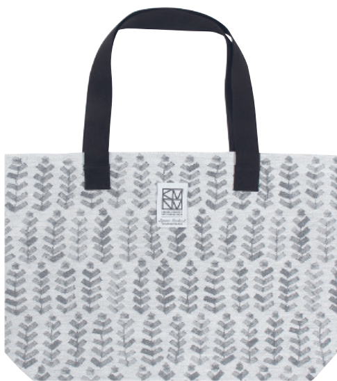
TERVA towel 48x70 cm, col. white-multi-aspen green, washed linen-tencel-cotton, design Lapuan Kankurit