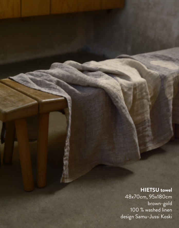
HIETSU towel 48x70cm, 95x180cm brown-gold 100 % washed linen design Samu-Jussi Koski